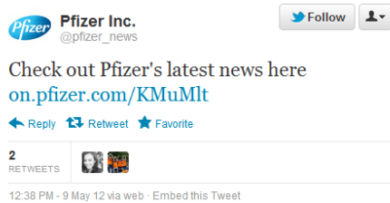
(a) Changed and Relevant