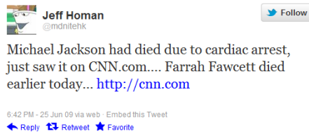
(b) Changed and no longer Relevant