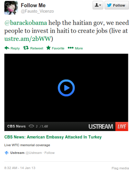
(c) Using the twitter expanded interface showing a third state of the resource.