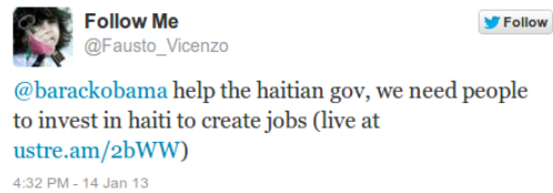
(a) A tweet depicting Obama's news conference and the topic of the Haitian Earthquake

Intention, mood, and sentiment have been analyzed in different contexts, but not with respect to time. Furthermore, this research builds on a large body of work involving de-