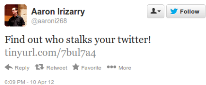
(d) Not Changed and not Relevant