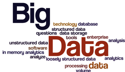
Image from [1].

The emphasis of the camp is to understand what is Big Data data analysis beyond the marketing hype of the 3Vs of volume, variety, and velocity,