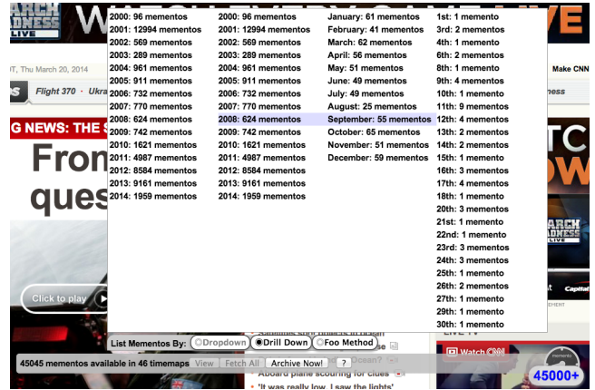
Figure 3: For a large number of mementos (shown here for CNN.com), Miller columns provide an alternative to simple drop down menu selection, which would be taxing for browsers because of the large number of entries in the select box.

One of the primary reasons for content negotiation to the archives in the Memento Framework is the large quantity of content contained within. Even for URIs with a